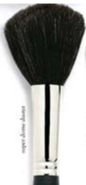
super dome shaver