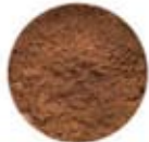
touch of sun

Our powders are translucent finishing powders, oil absorbing, pore minimizing and can be worn under or over the mineral foundations. Touch of Sun bronzer gives you that just back from the beach look.