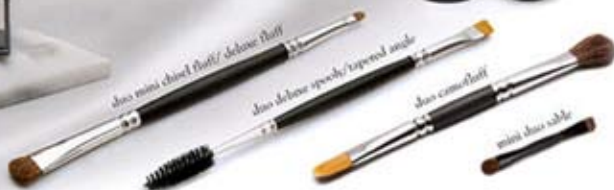
also mini chisel fluff/ double fluff