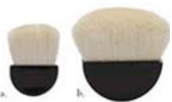
a. mini half moon b. half moon powder

We have the best and biggest collection of Kabuki brushes. Our Luscious Kabuki is made with the finest and softest hair available. Domed or flat tops, with wooden handles or retractable... you choose.